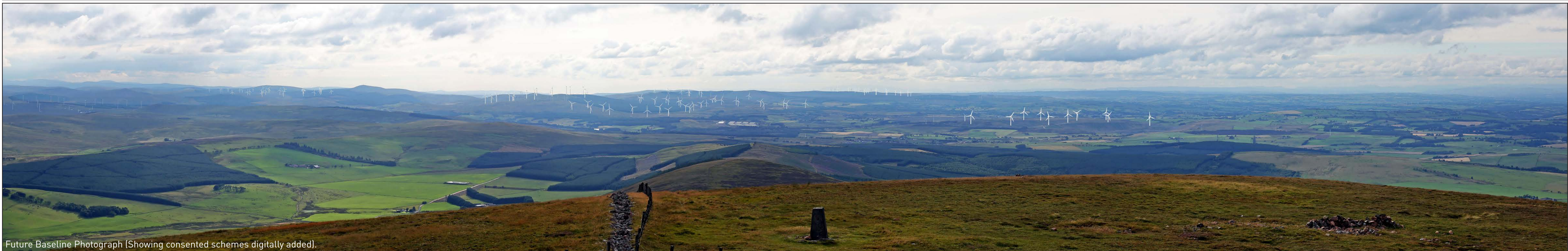
Future Baseline Photograph (Showing consented schemes digitally added).