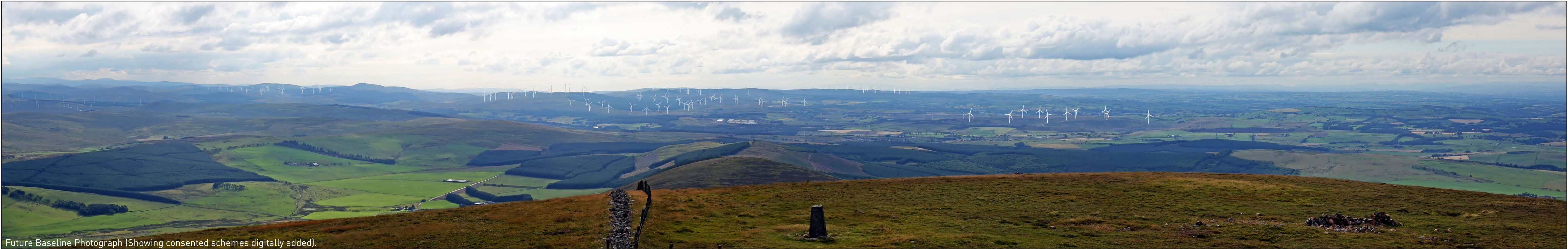
Future Baseline Photograph (Showing consented schemes digitally added).