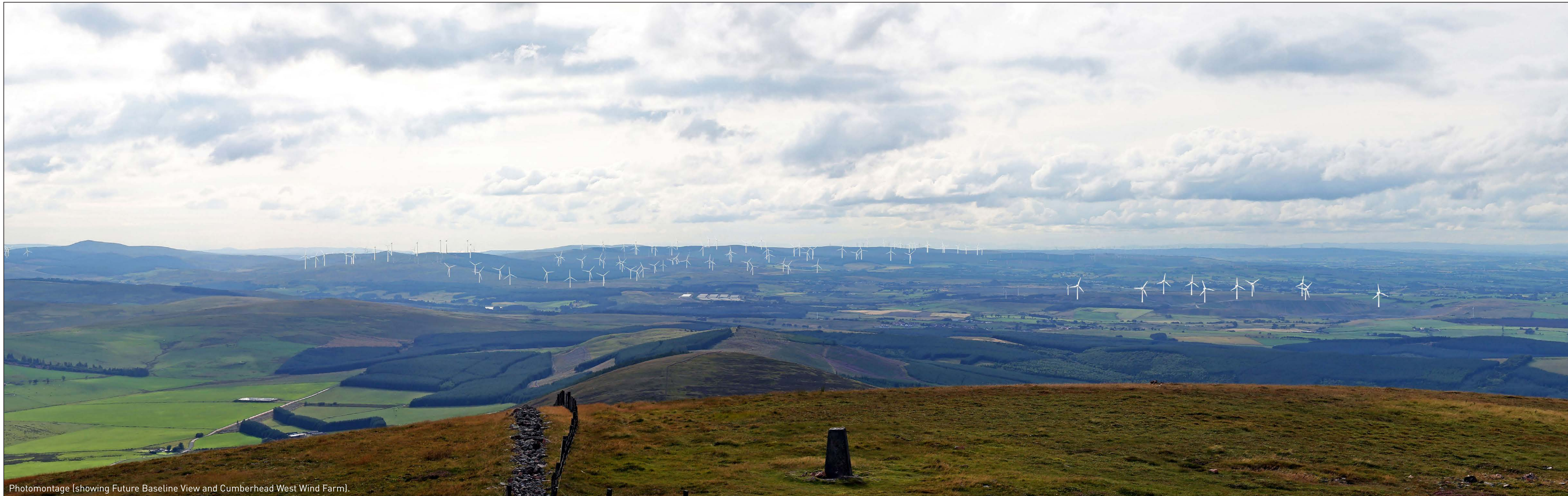
Photomontage (showing Future Baseline View and Cumberhead West Wind Farm).